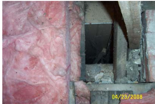
An attic by-pass

Whenever possible, helpful web site addresses are included as well.